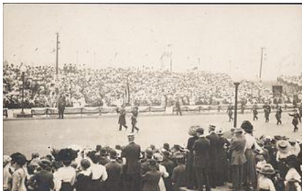
Knights of Pythias in a parade in Racine, Wisconsin , ca. 1910

The Knights of Pythias is a fraternal organization and secret society [2] founded in Washington, D.C. , on 19 February 1864.